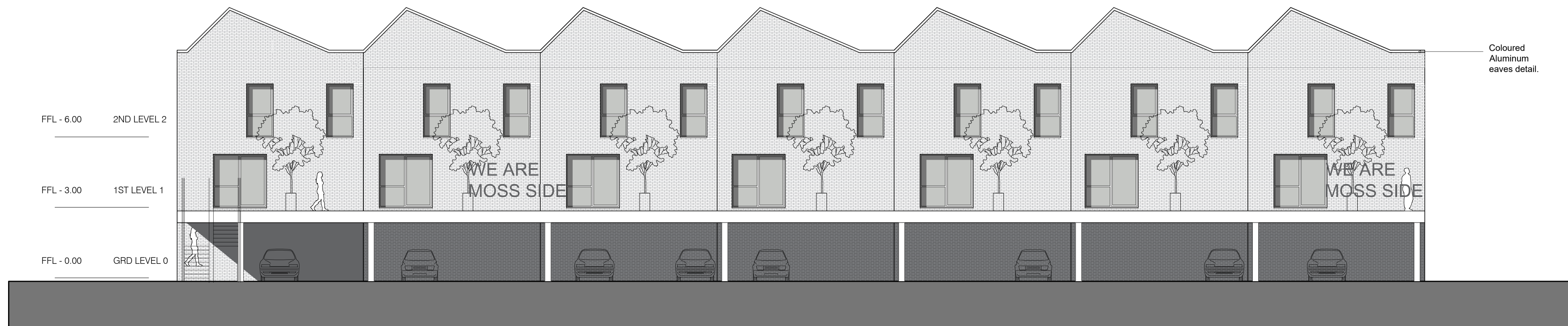
Townhouses West Elevation 1:100

MC AU Modern City Architecture & Urbanism 2 Commercial Street Castlefield Manchester M15 4RQ t: 0161 974 7203 e: info@mcau.co.uk www.mcau.co.uk