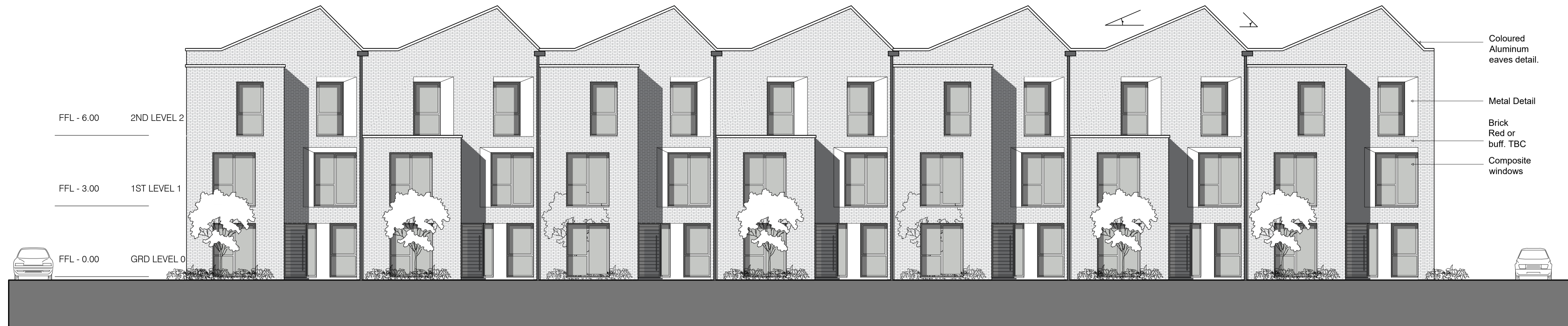
Townhouses East Elevation 1:100